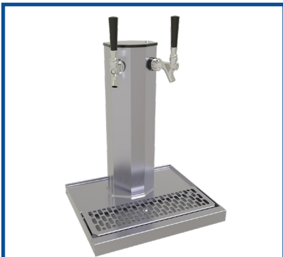
Grainline, Mirror, or Brass-Finish Options for Column Towers