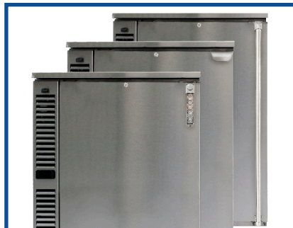
Signature, Pull-Tab, or Tube Handles