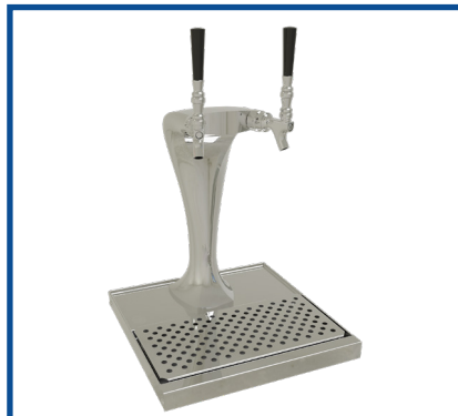
Mirror or Gold-Finish Options for Cobra Towers